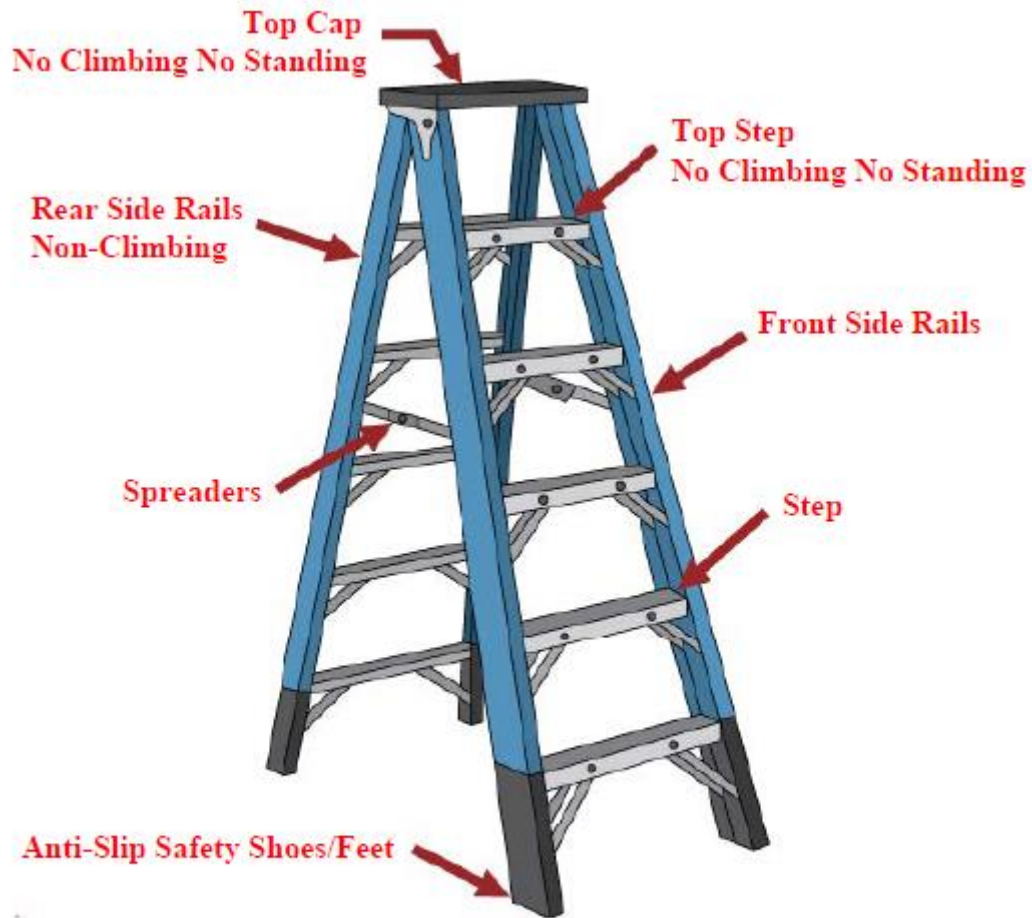
Single-Sided Step Ladder

Allow for movement and electrical line sway or sag, and be aware of strong or gusty winds. Do not use the ladder as a ground for welding