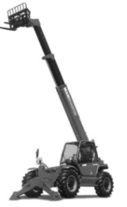
4 x 4 Forklift